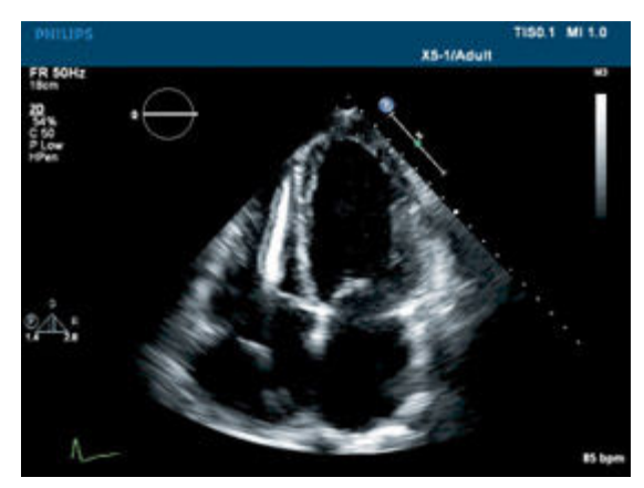
Even in technically difficult heart failure studies, the myocardium and endocardium are displayed with superb detail and contrast resolution from the apex to the atria.